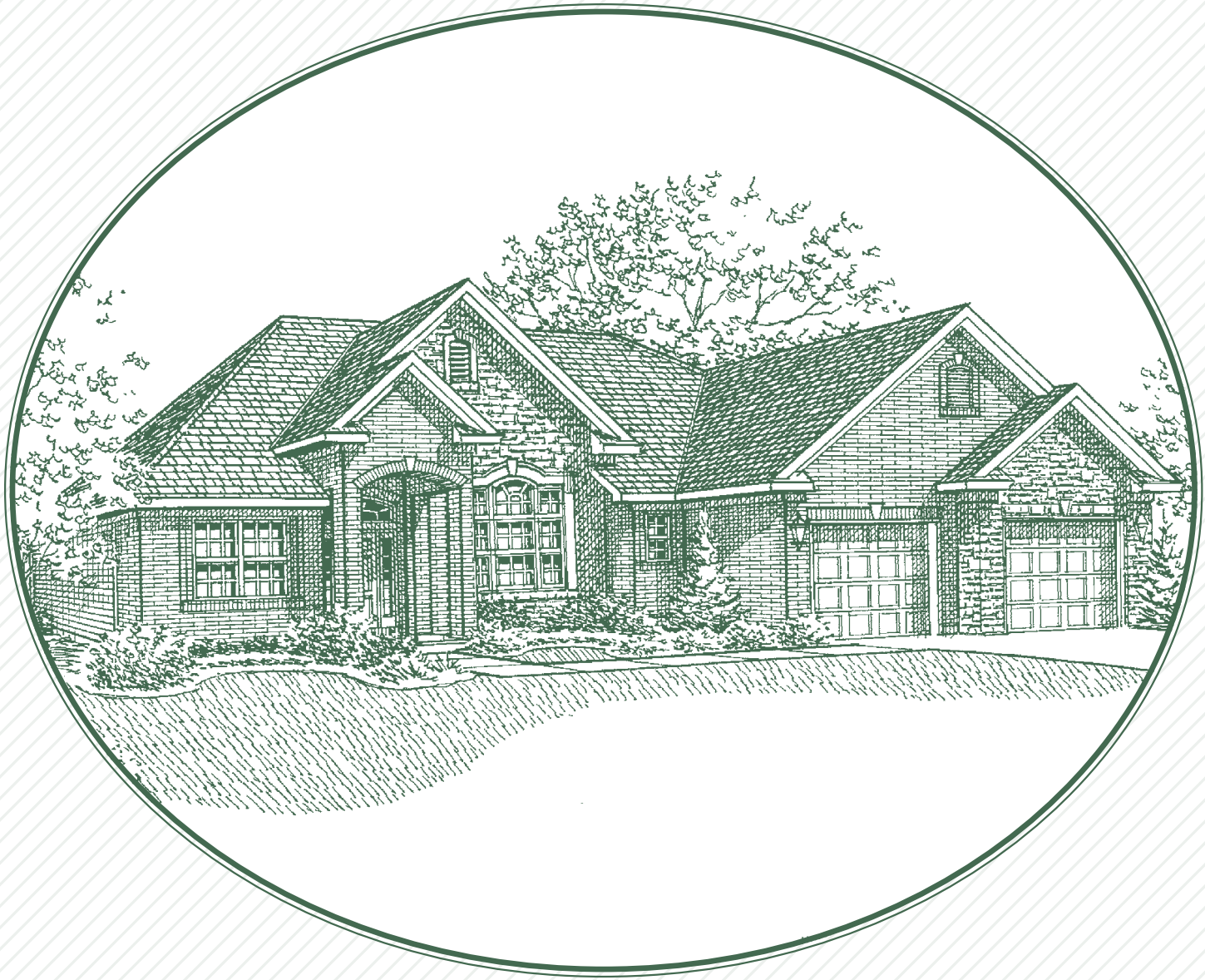
Elevation D with Opt. Stone